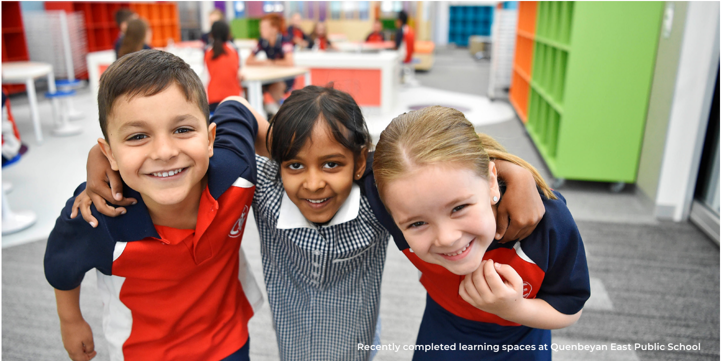
Recently completed learning spaces at Quenbeyan East Public School