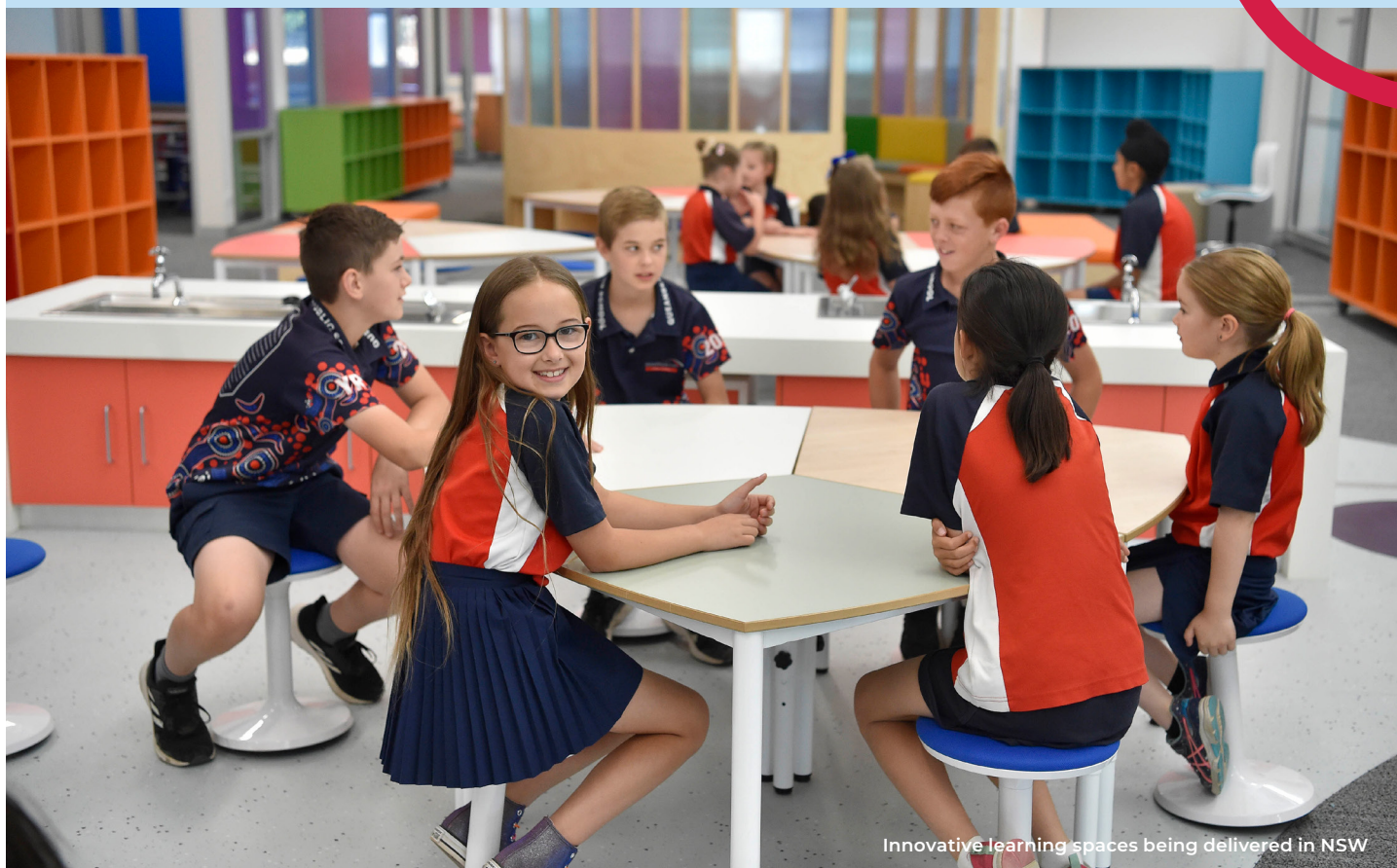
Innovative learning spaces being delivered in NSW

The NSW Department of Education is coordinating an emergency response effort that is unprecedented in terms of scale and impact. A large number of schools in the Northern Rivers region have damage to either the entire site or some buildings and facilities.