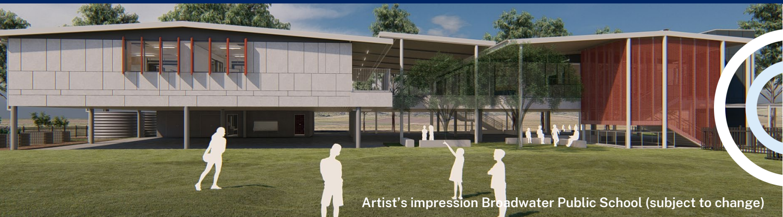
Artist's impression Broadwater Public School (subject to change)