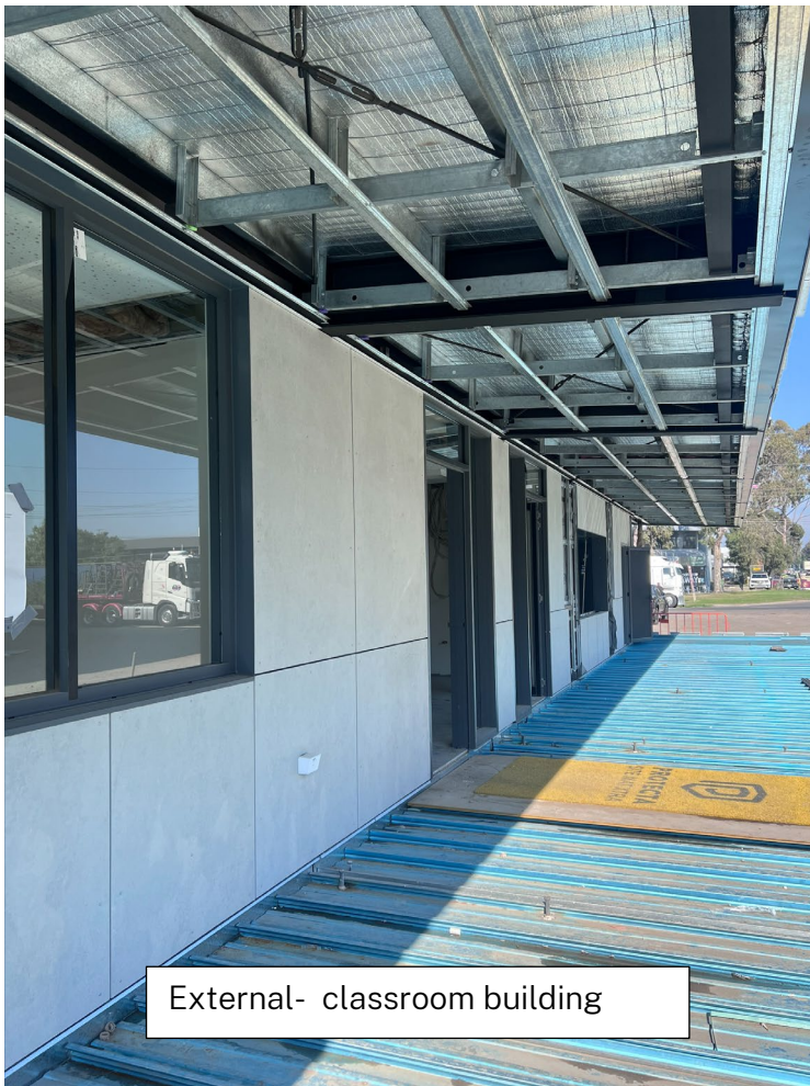
External- classroom building