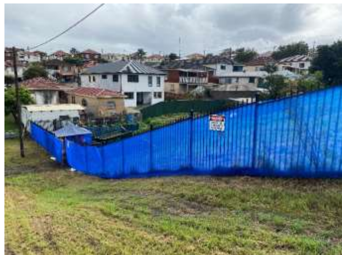
Picture 2 – Exclusion zone fencing surrounding north-western hotspot area