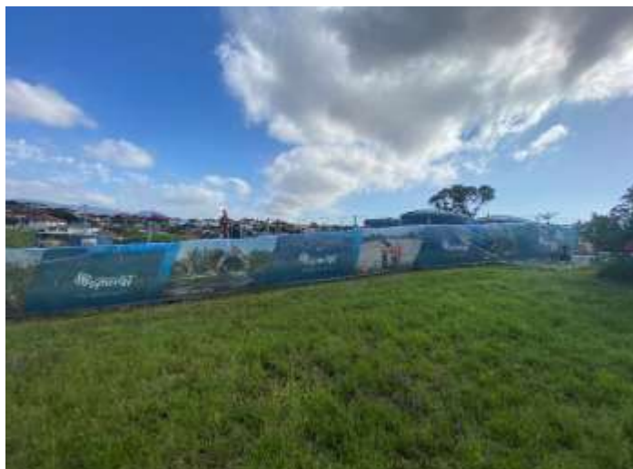
Picture 1 – Exclusion zone fencing surrounding north-western hotspot area