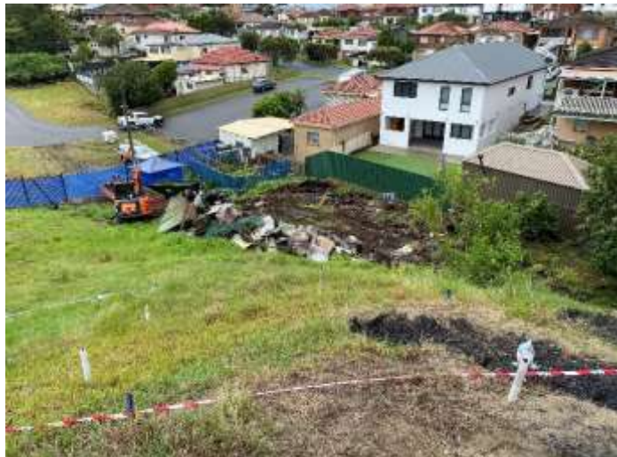
Picture 7 – Structure demolition works at the foot of the embankment