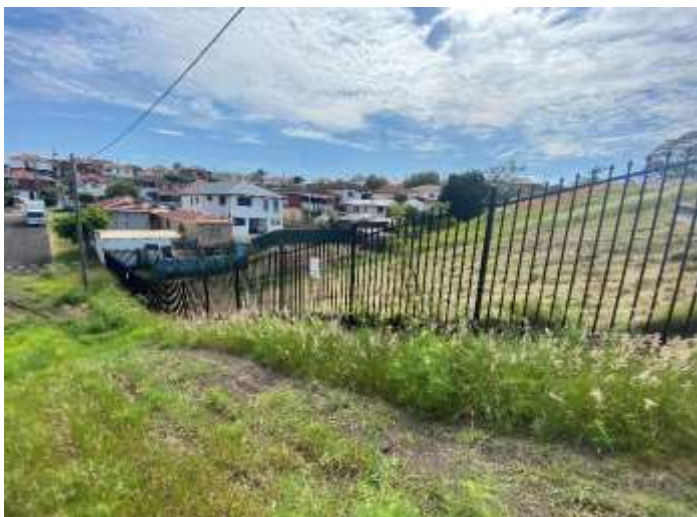
Picture 1 – Exclusion zone fencing surrounding north-western hotspot area