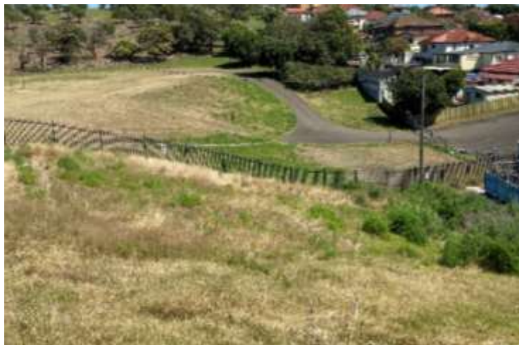
Picture 1 – Exclusion zone fencing surrounding north-western hotspot area