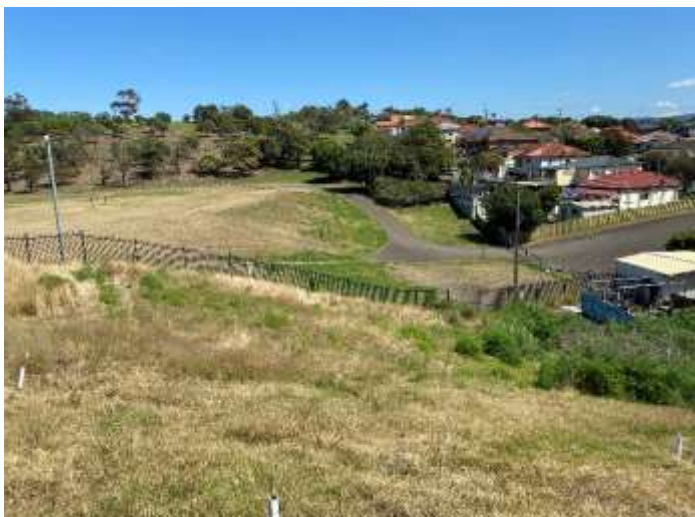
Picture 1 – Exclusion zone fencing surrounding north-western hotspot area