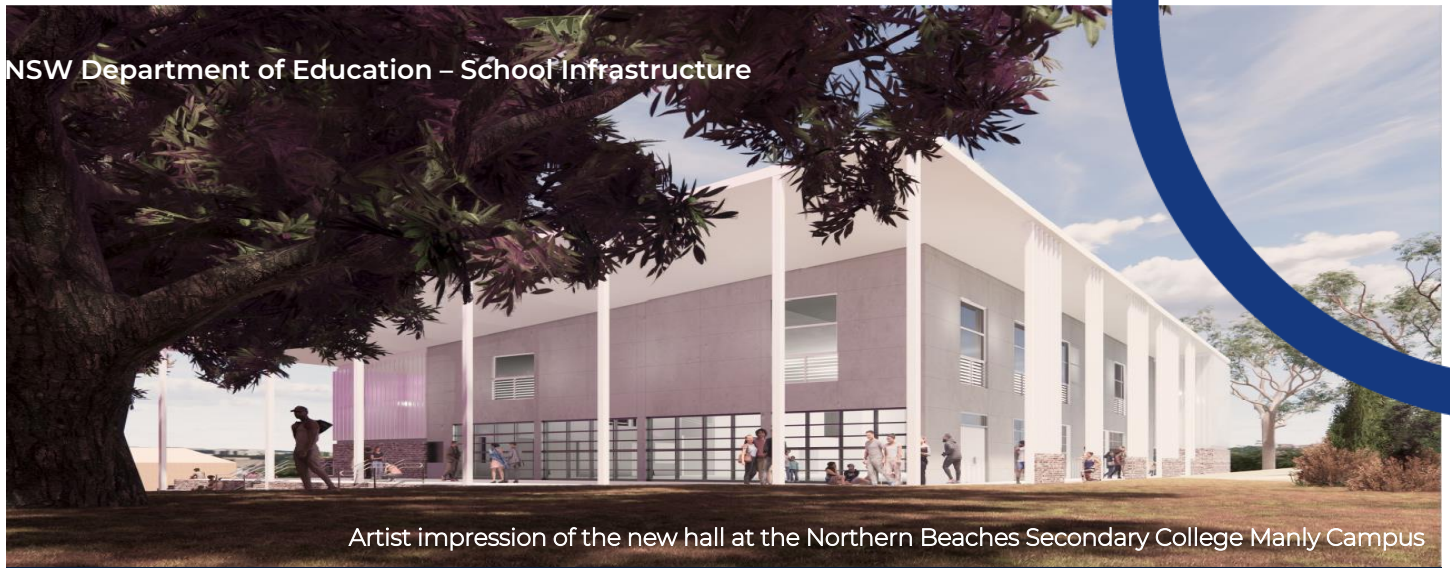
Artist impression of the new hall at the Northern Beaches Secondary College Manly Campus