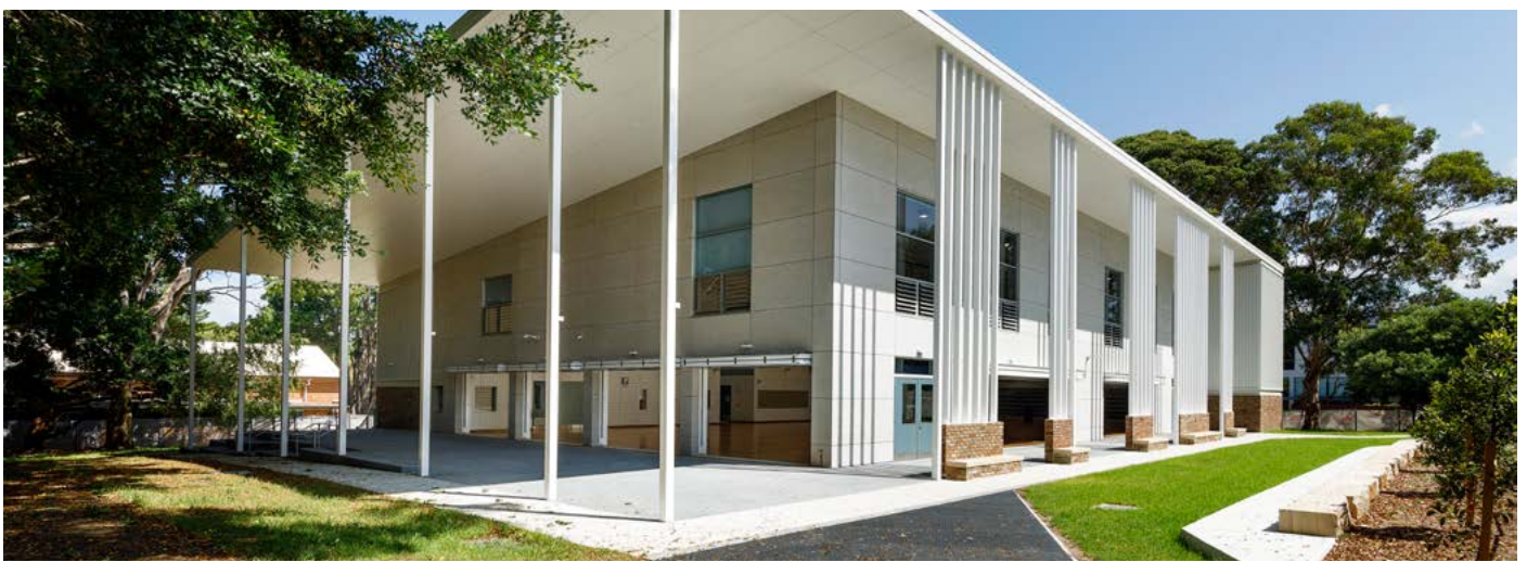
Hall exterior, including COLA, walkways and footpaths