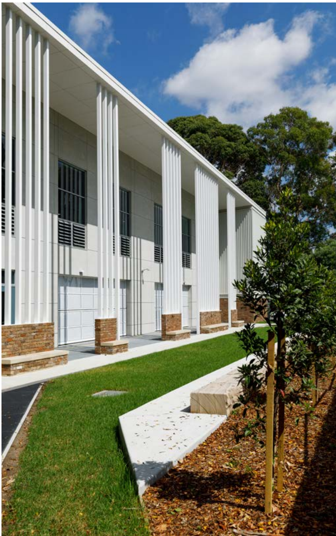
External view of hall