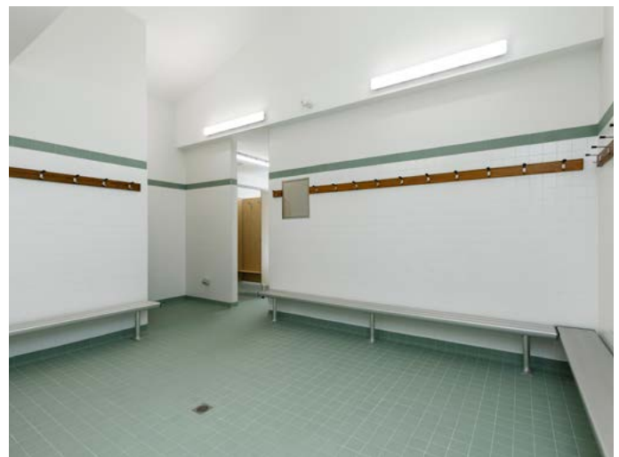
Bathrooms and amenities including showers and changerooms