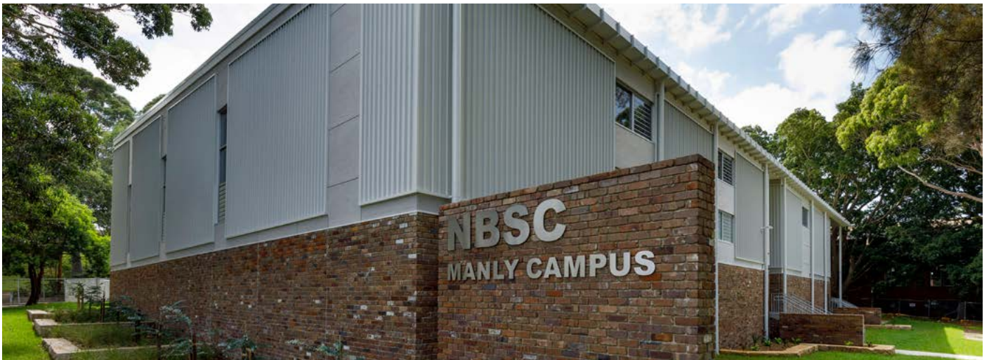
NBSC Manly Campus multipurpose hall