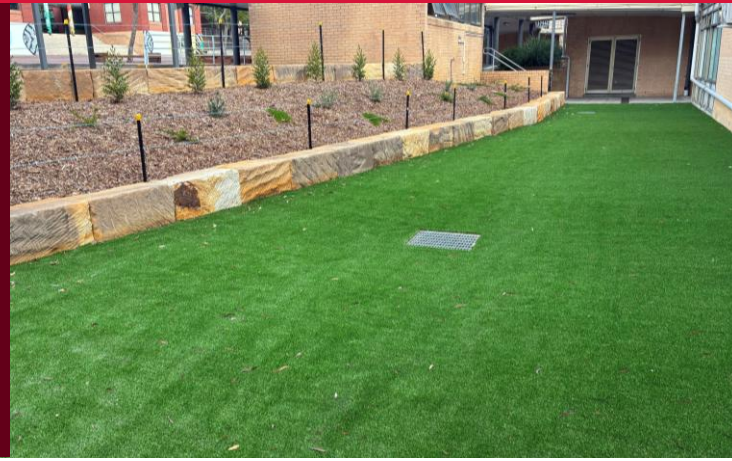
Image caption: Tuggerah Lakes Secondary College, Berkeley Vale Campus outdoor area