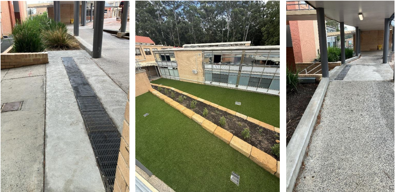
Images above: new outdoor seating area, landscaping and improved drainage around buildings E, F, and G.