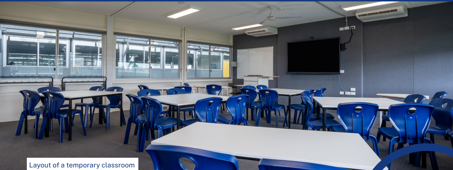
Layout of a temporary classroom