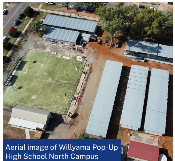
Aerial image of Willyama Pop-Up High School North Campus

We have worked closely with the Department of Education leadership to ensure the spaces will suit Willyama High School students' educational needs. With a wide range of learning spaces, temporary schools deliver the full subject offering at a standard expected in all public schools.