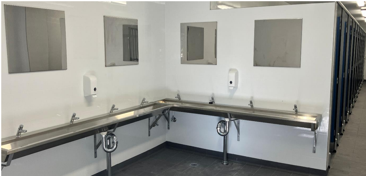
Upgraded bathrooms at Pittwater High School.

We are thrilled to have delivered this project for the school community.