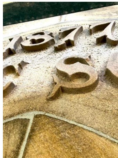
Images above from left: North-eastern side of Building A after scaffold removal and detail of stone restoration on building façade showing the school's name.