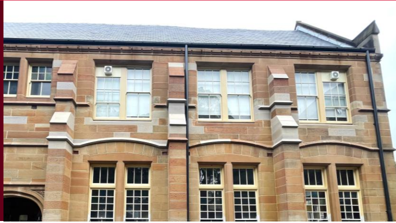
Image caption: southern side of Building A at Rozelle Public School