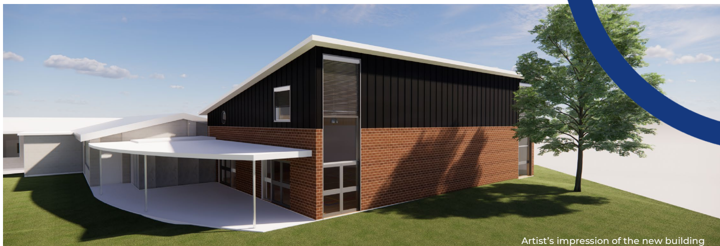
Artist's impression of the new building