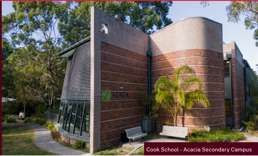
Cook School - Acacia Secondary Campus

As part of the NSW Government's plan to rebuild public education, the NSW Budget is delivering record education funding, including $9 billion for new and upgraded schools. This targeted investment will ensure growing communities get access to a world class public education.