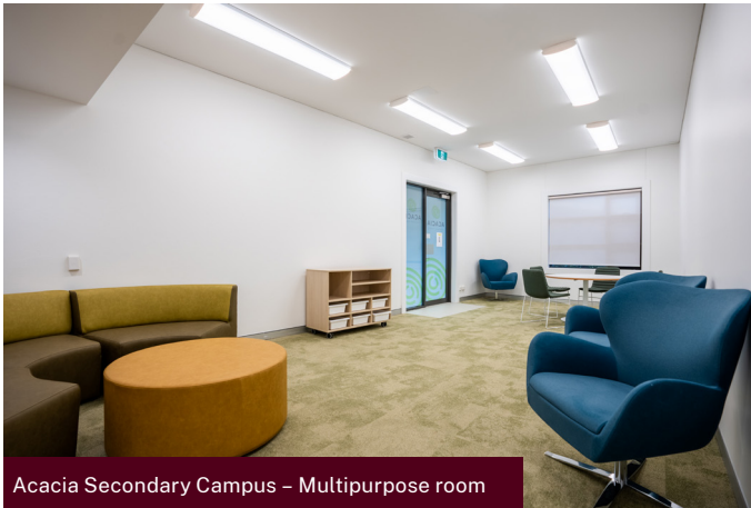
Acacia Secondary Campus – Multipurpose room