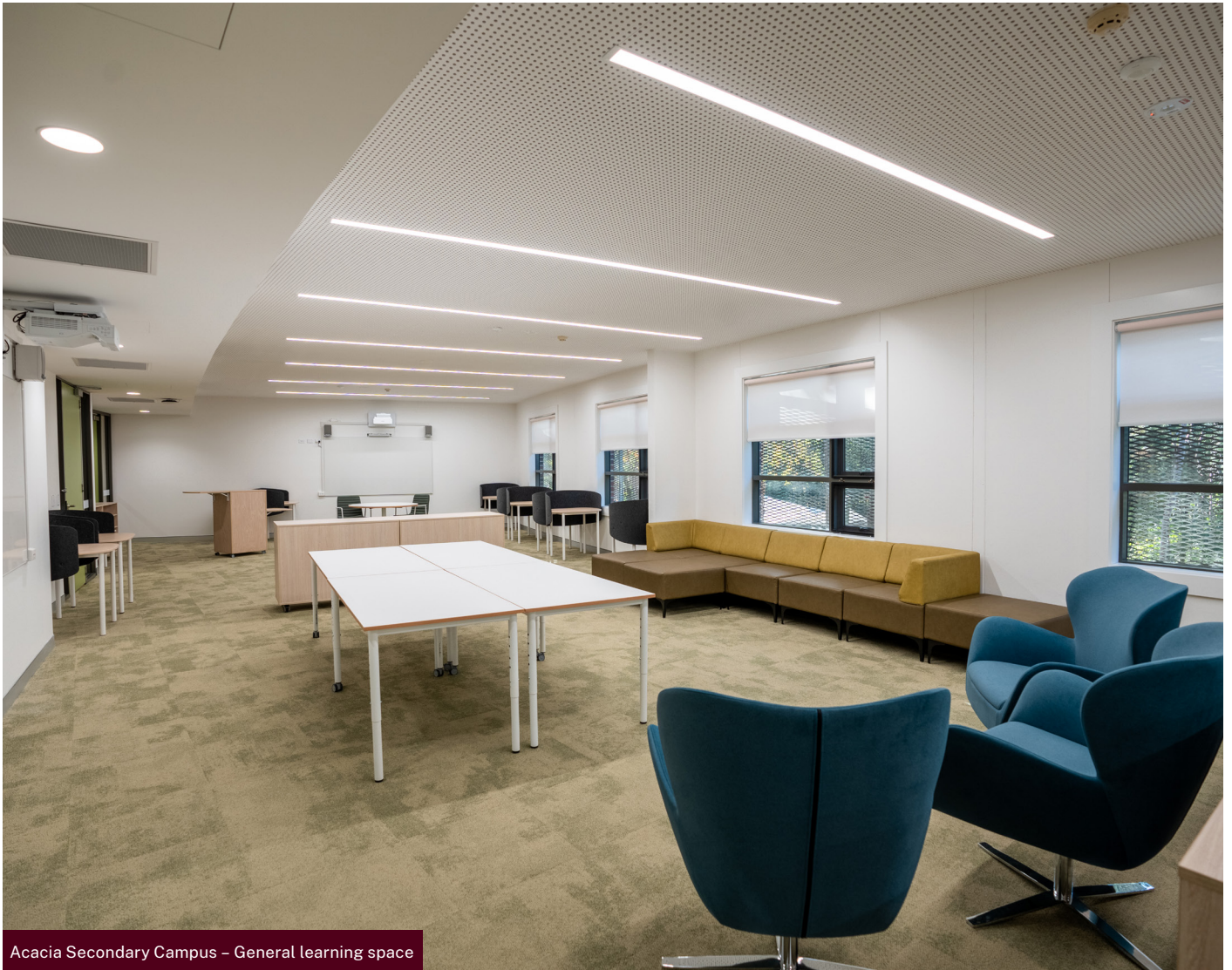
Acacia Secondary Campus – General learning space