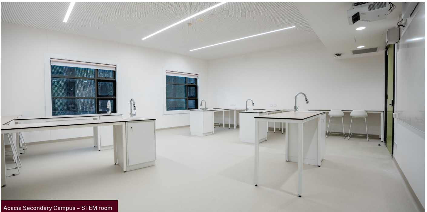
Acacia Secondary Campus – STEM room