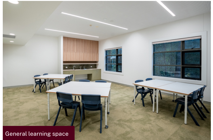
General learning space