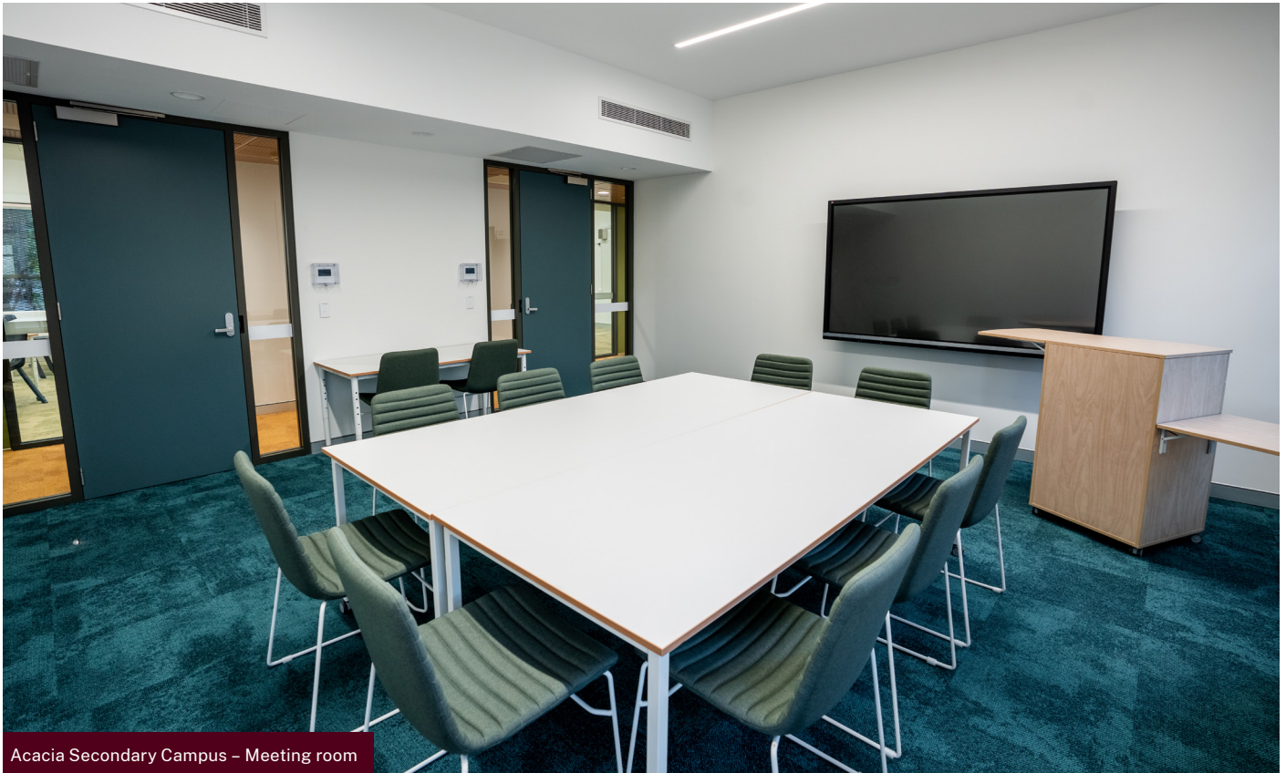
Acacia Secondary Campus – Meeting room