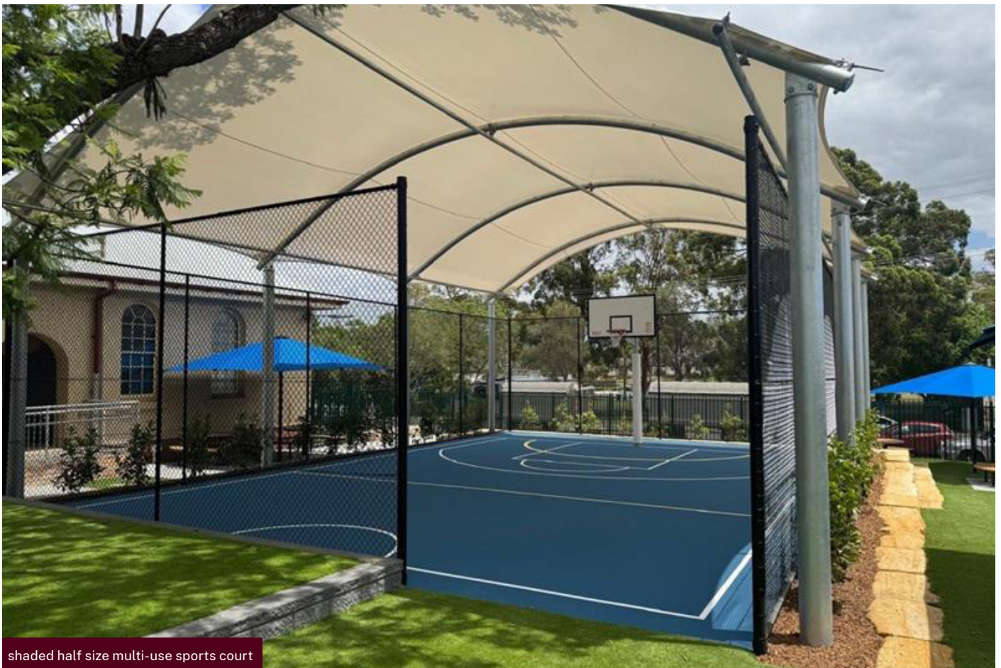
shaded half size multi-use sports court