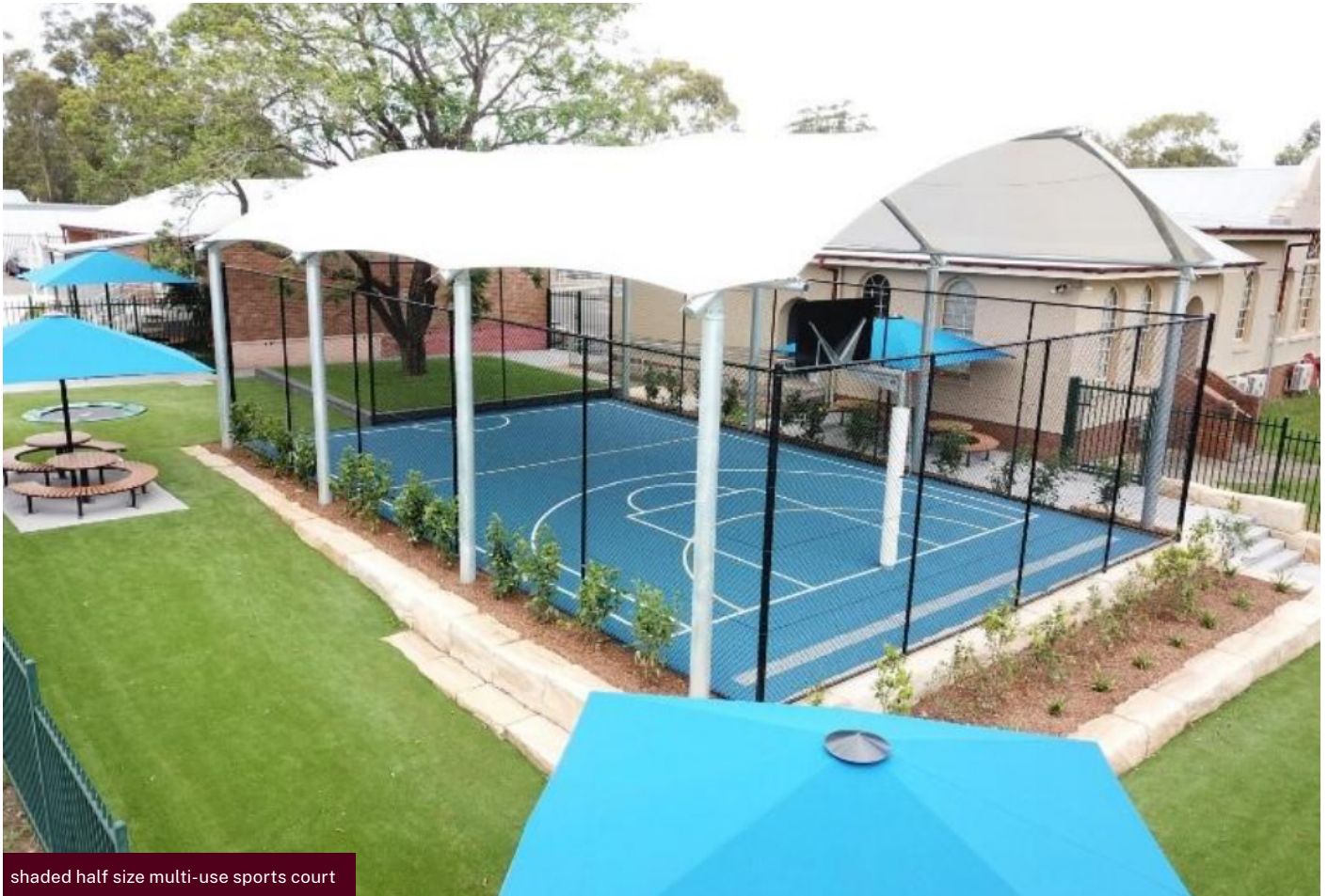
shaded half size multi-use sports court