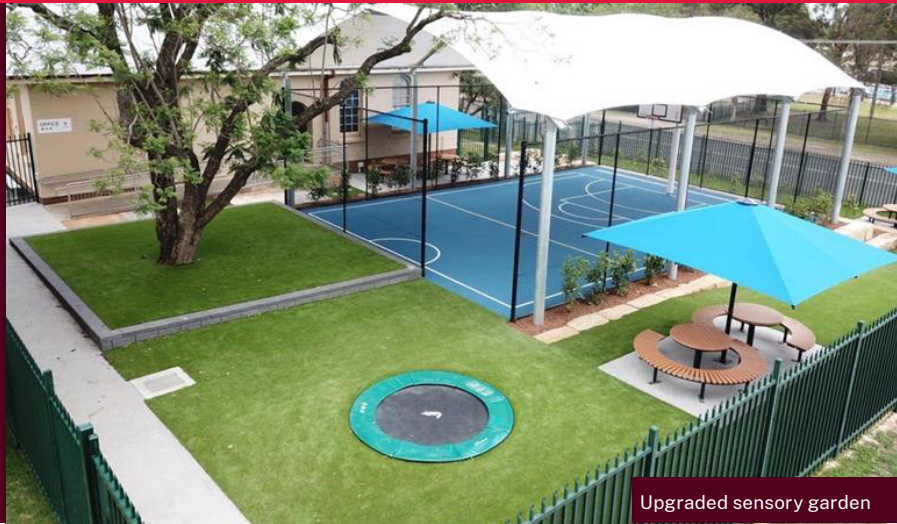
Upgraded sensory garden

Sensory Garden Upgrade Completion Pack - October 2025