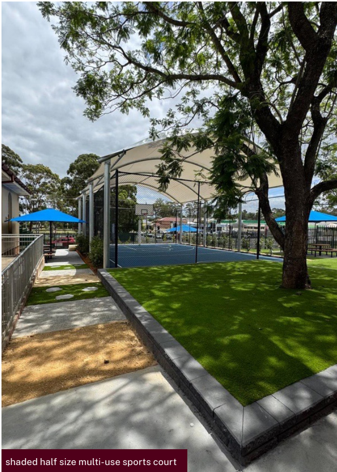
shaded half size multi-use sports court