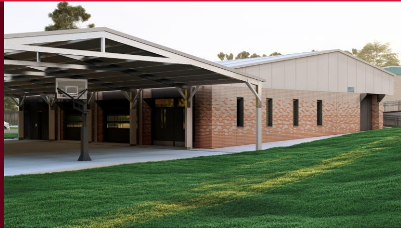
Image caption: artist impression showing external view of the hall (subject to change)