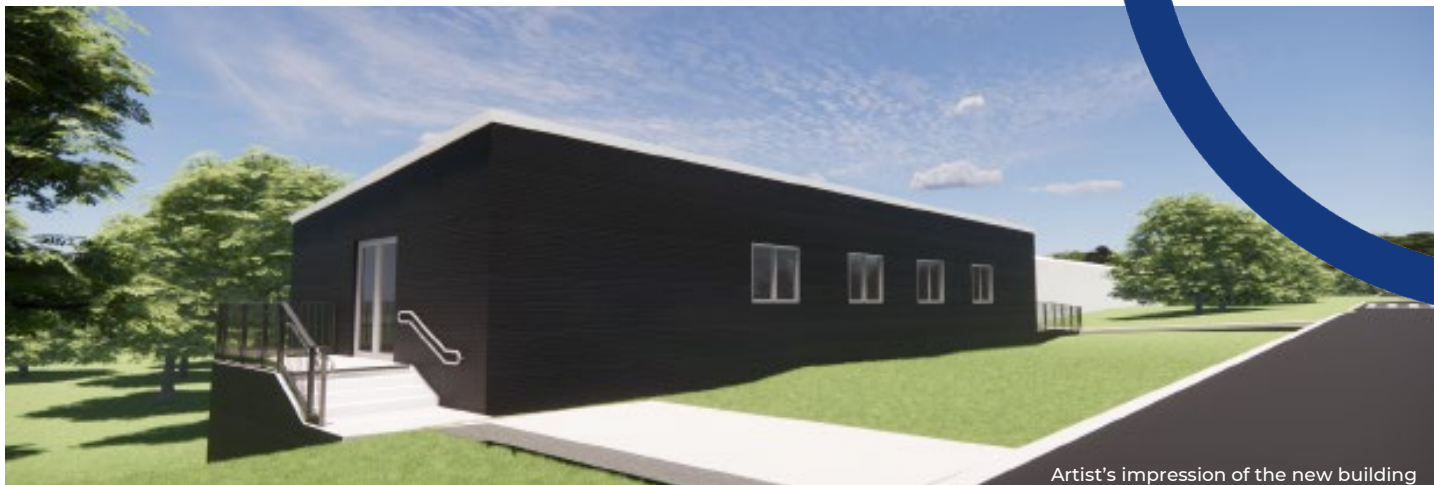
Artist's impression of the new building