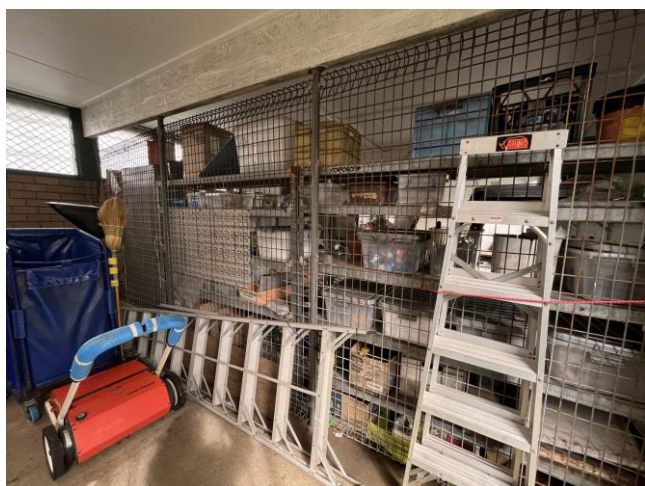
Before: art cave interior