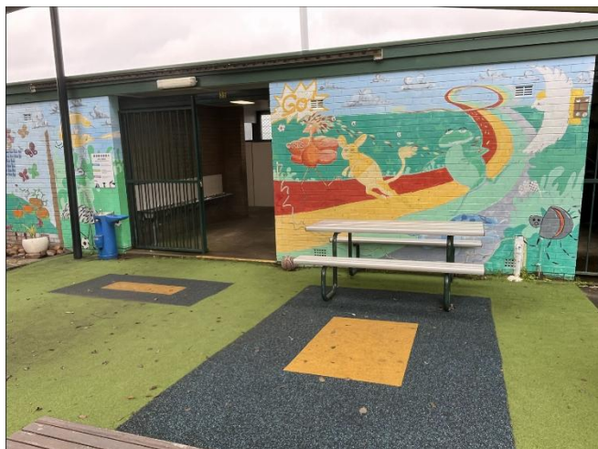
Before: art cave exterior