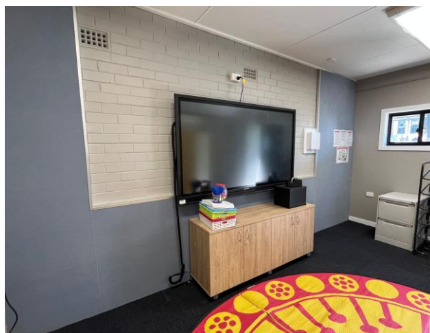
After: art cave interior