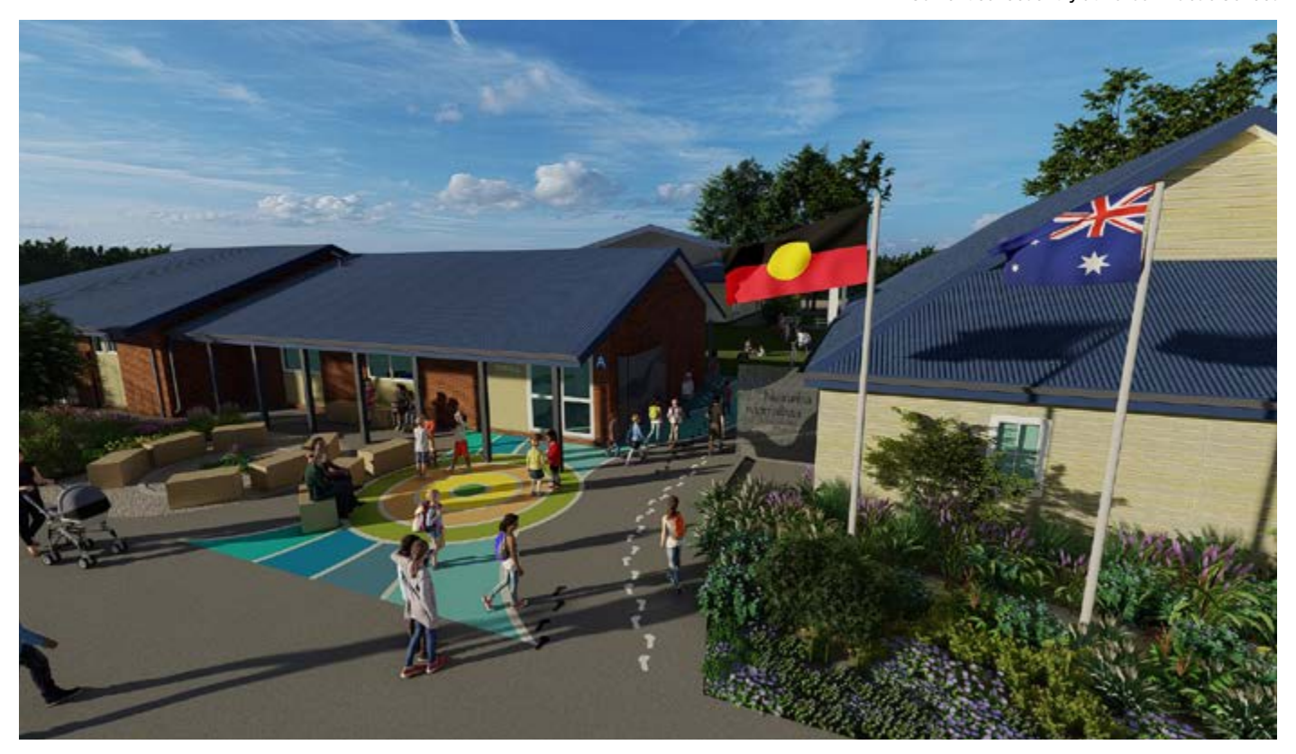
Artist impression of the new school entry and administration building