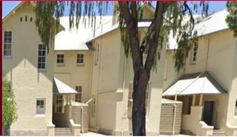
Image caption: Building A