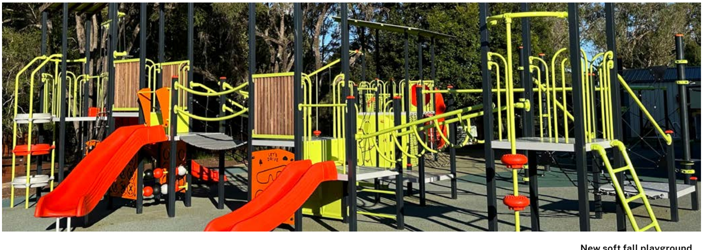
New soft fall playground