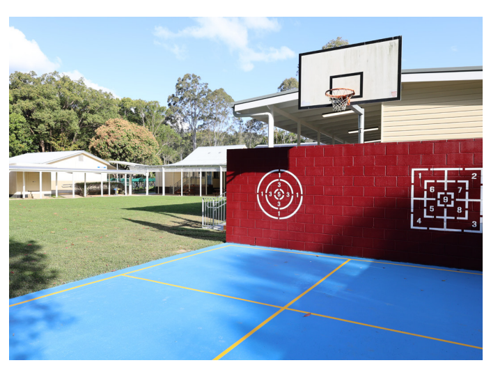
Remediated play areas