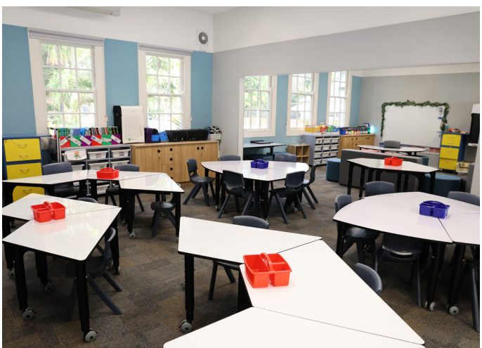
Modern classroom layout