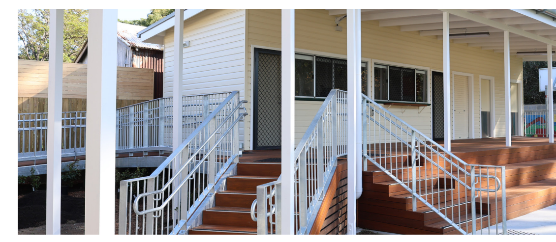
Raised and renovated canteen, extended seating, access ramp and covered walkways