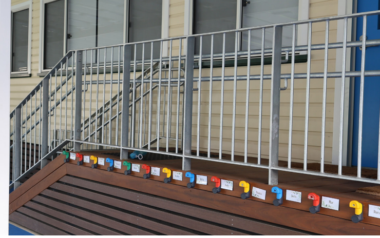
Raised and renovated classroom and administration buildings