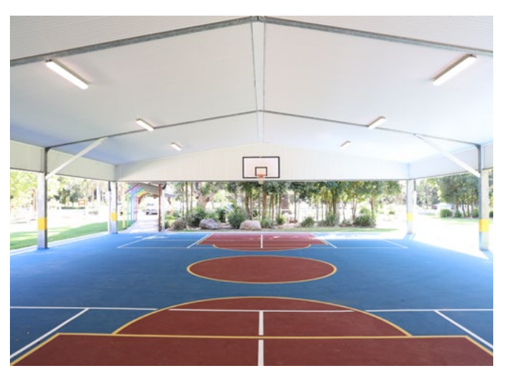
Resurfaced sports court and acoustic lined COLA