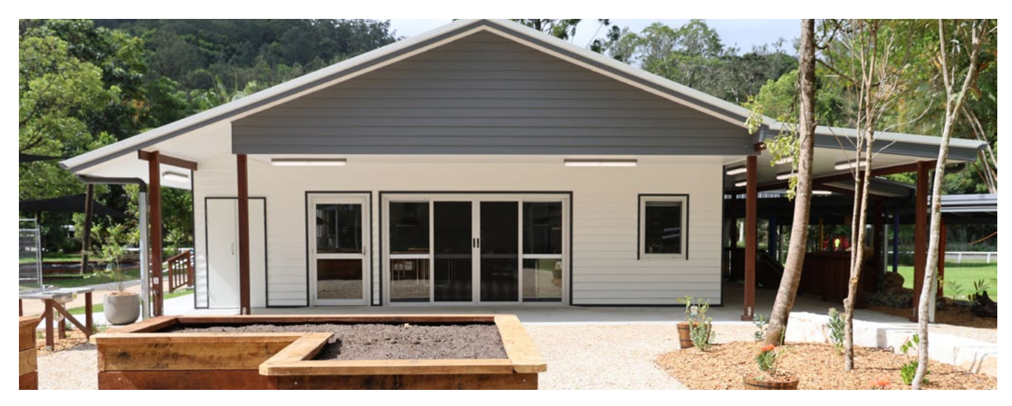
Rebuilt Classroom Block A