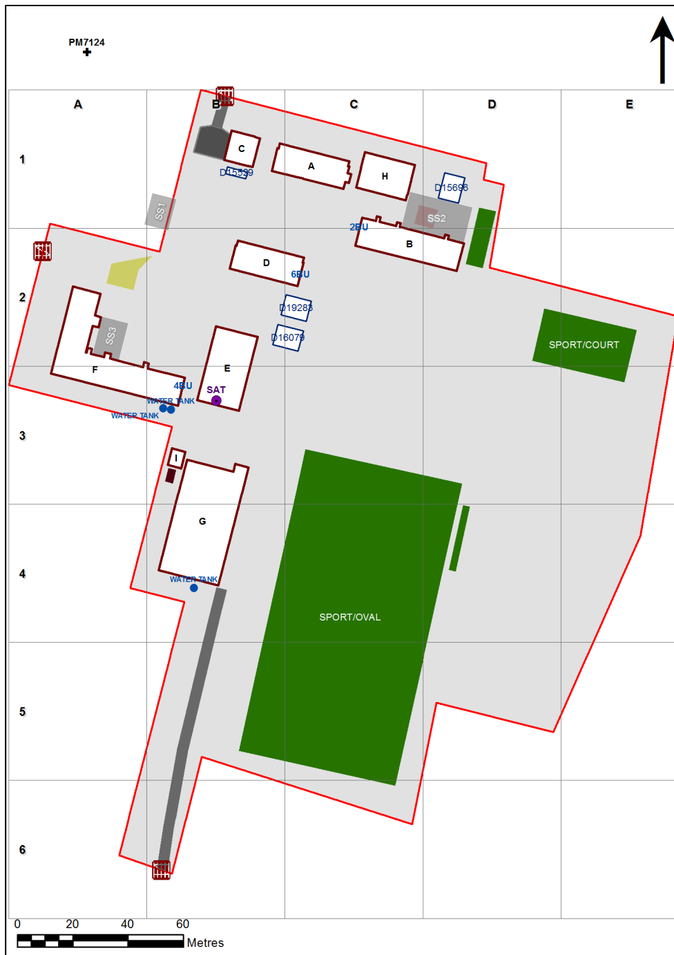
4131 - Young North Public School Site Plan (11421)