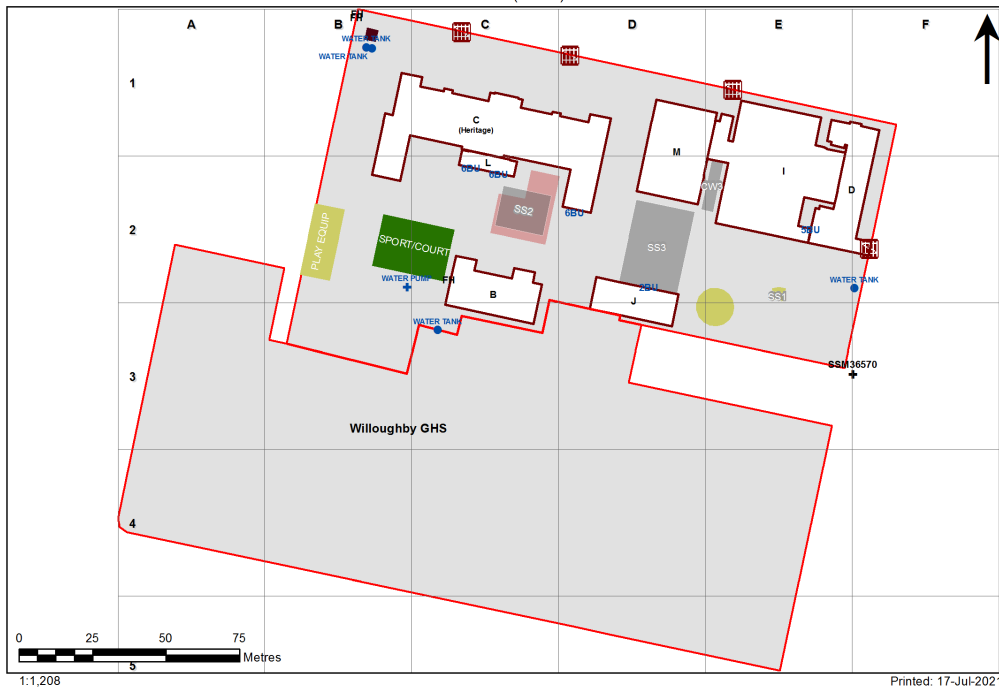
3449 - Willoughby Public School Site Plan (12818)