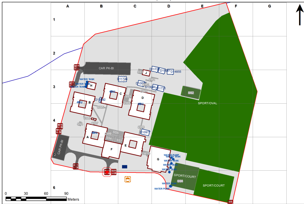
8440 - Warners Bay High School Site Plan (11380)