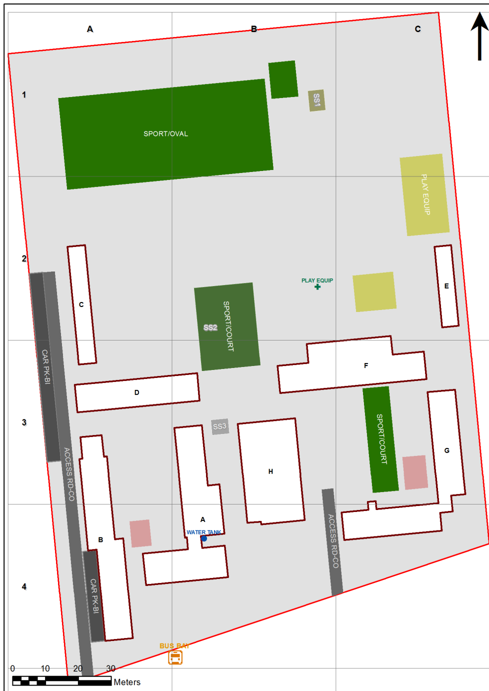
4368 - Wakehurst Public School Site Plan (11369)