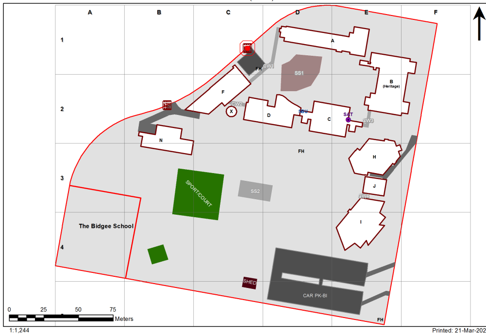
8142 - Wagga Wagga High School Site Plan (11565)