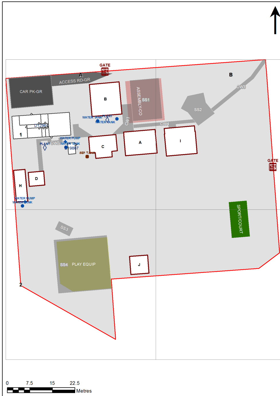
3304 - Ulong Public School Site Plan (11841)