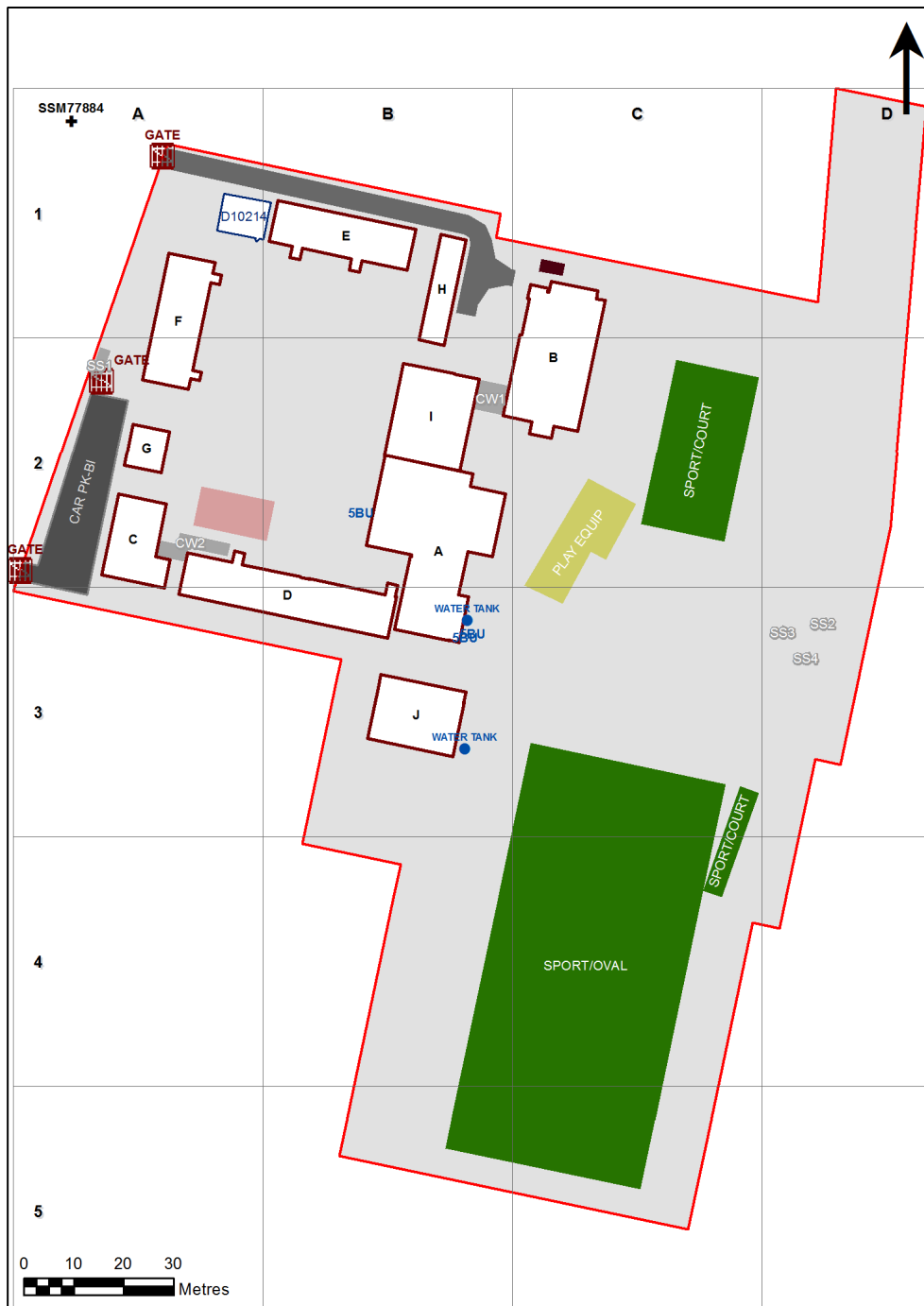
3288 - Turrumurra North Public School Site Plan (10781)