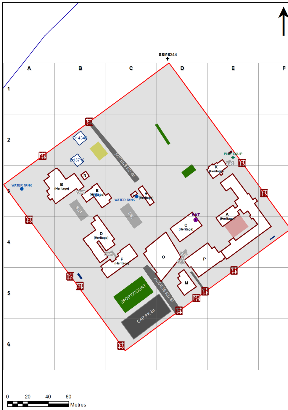
3157 - Tamworth Public School Site Plan (11530)