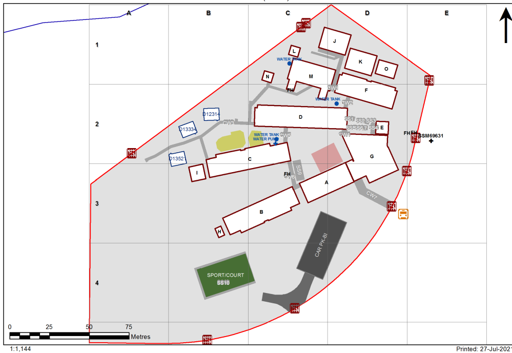
4617 - Tacking Point Public School Site Plan (10399)