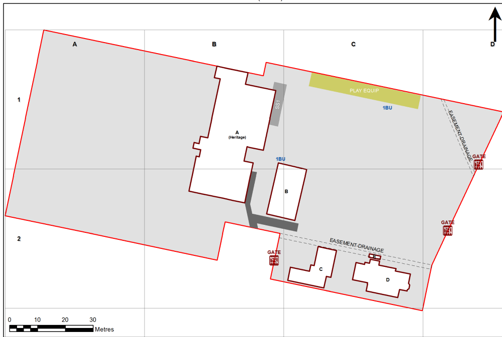
5515 - Stewart House School Site Plan (11316)