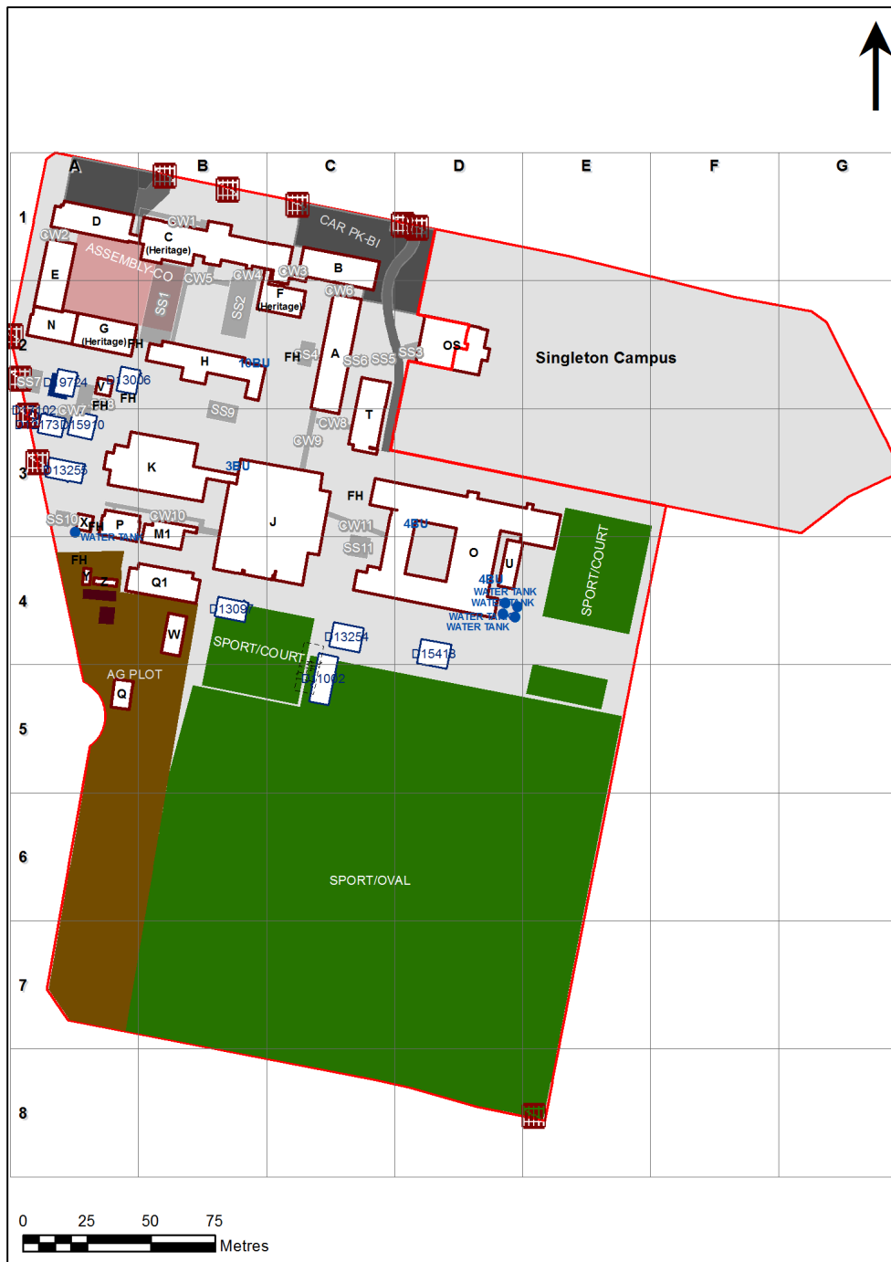
8202 - Singleton High School Site Plan (11303)