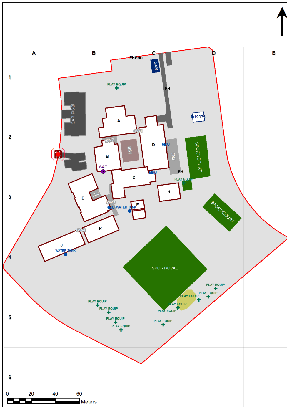
4486 - Singleton Heights Public School Site Plan (11304)