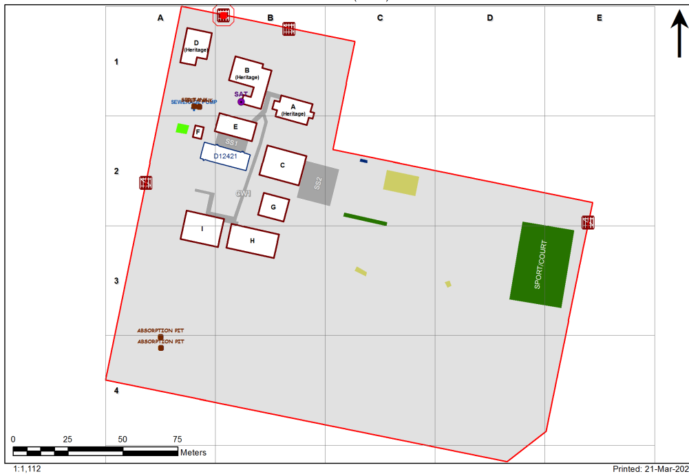
2971 - Robertson Public School Site Plan (10763)