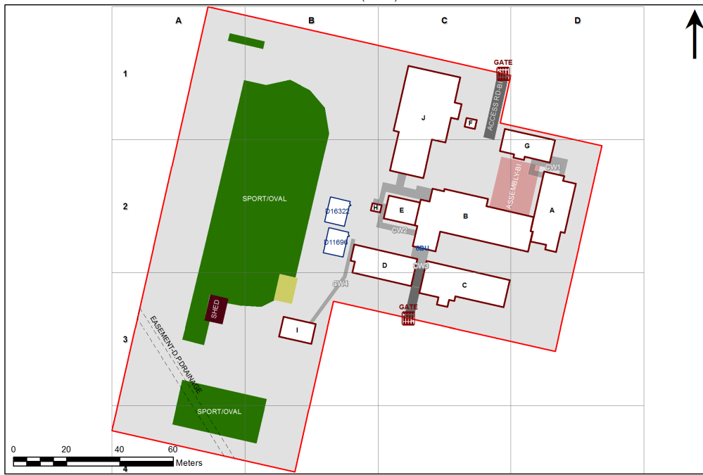
2946 - Redhead Public School Site Plan (12847)