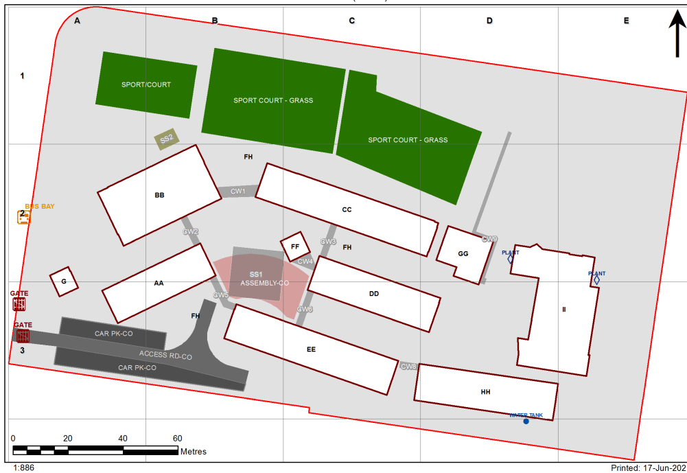
4212 - Quakers Hill East Public School Site Plan (13590)