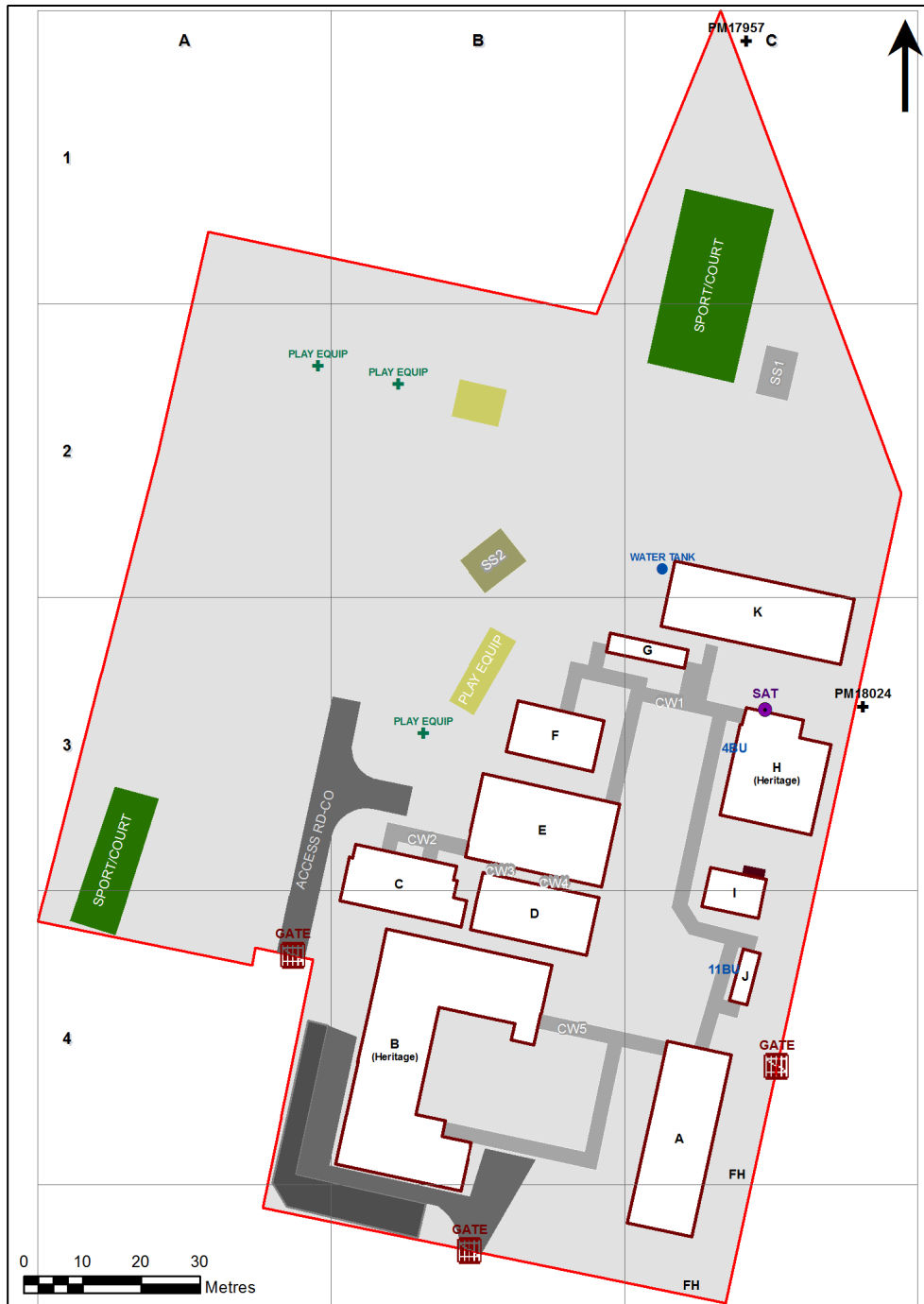
7308 - Plattsburg Public School Site Plan (11669)