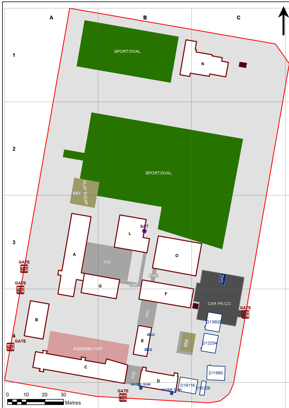
4204 - Parkes East Public School Site Plan (10503)