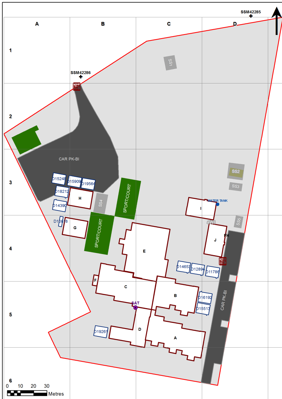
4549 - Orana Heights Public School Site Plan (10537)