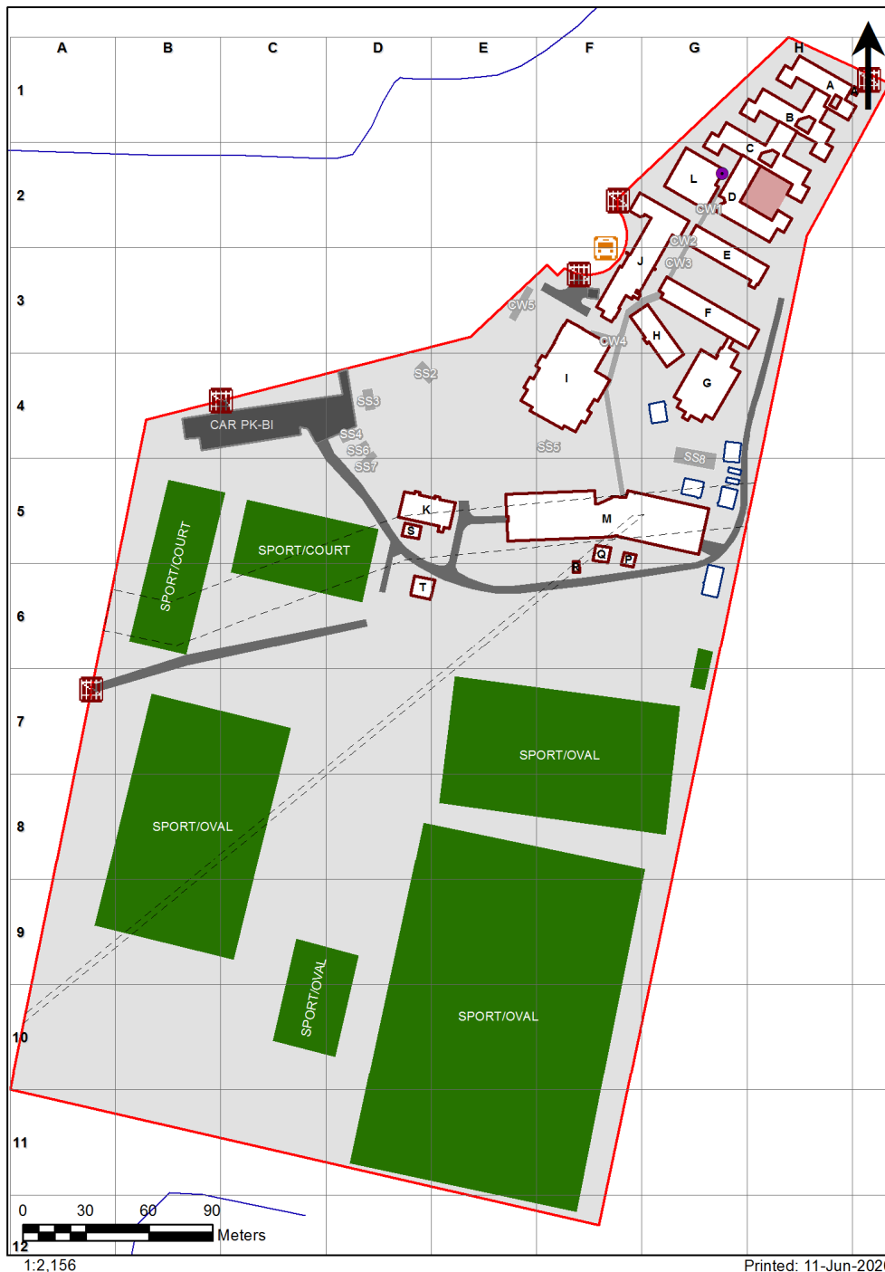
8201 - Nowra High School Site Plan (12417)