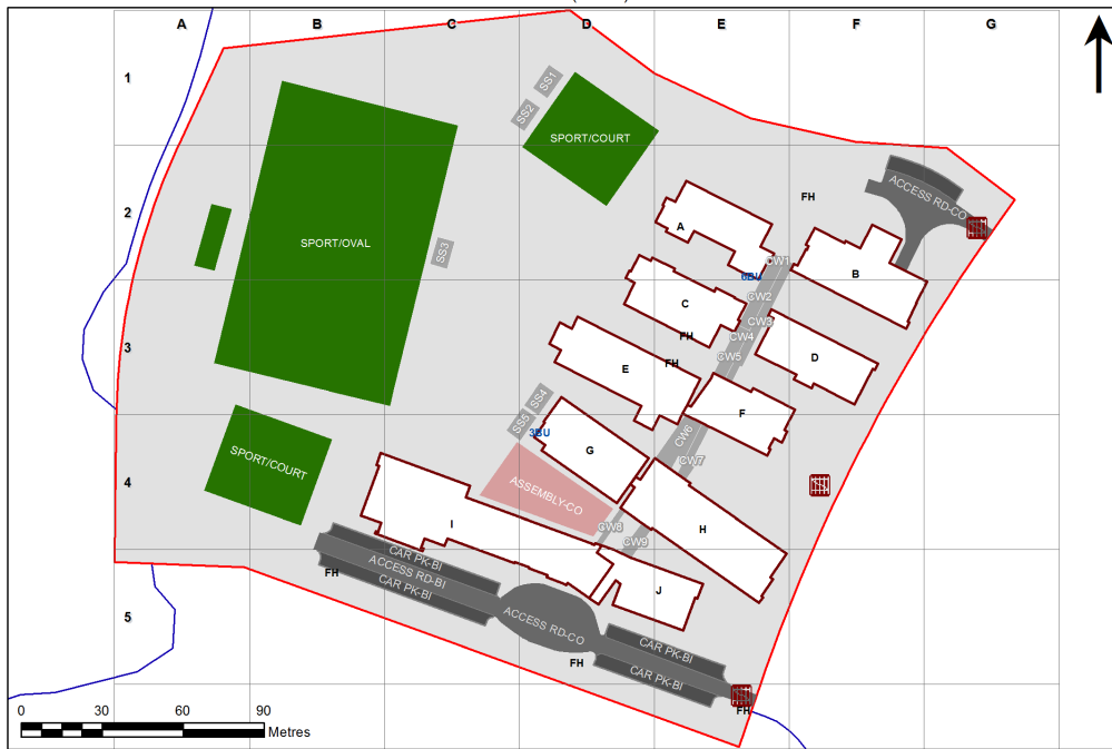
8286 - Mount Annan High School Site Plan (13451)