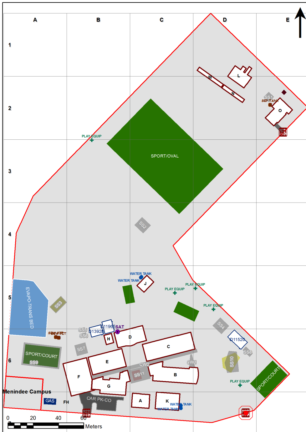
2523 - Menindee Central School Site Plan (10593)