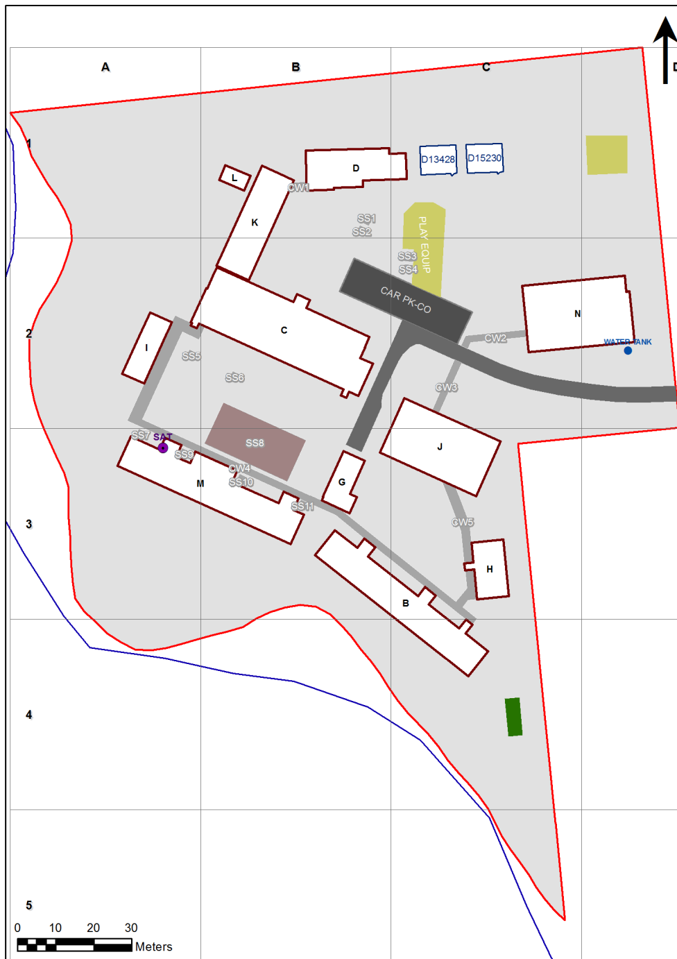
4042 - Lindsay Park Public School Site Plan (11560)