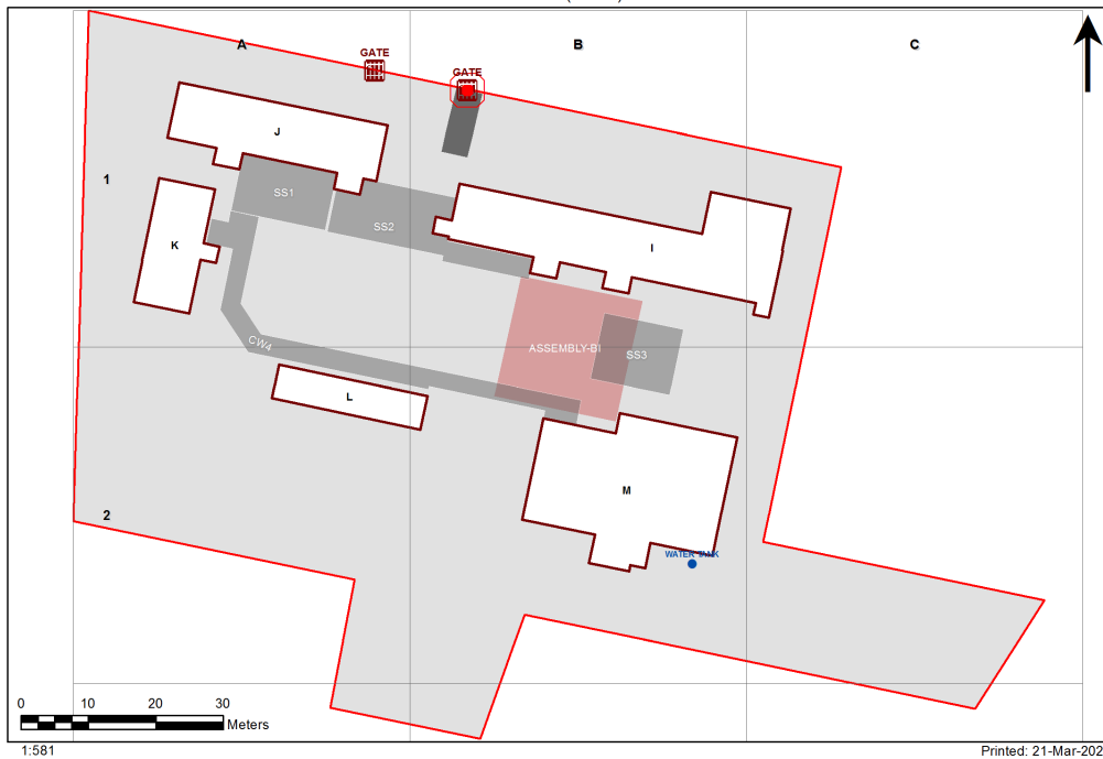
4084 - Lilli Pilli Public School Site Plan (13445)