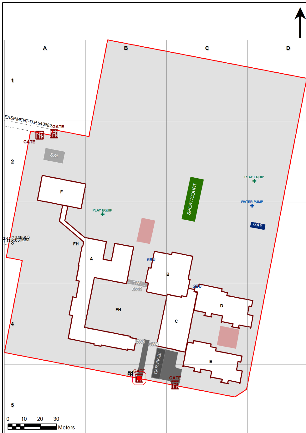
4546 - Katoomba Public School Site Plan (13199)