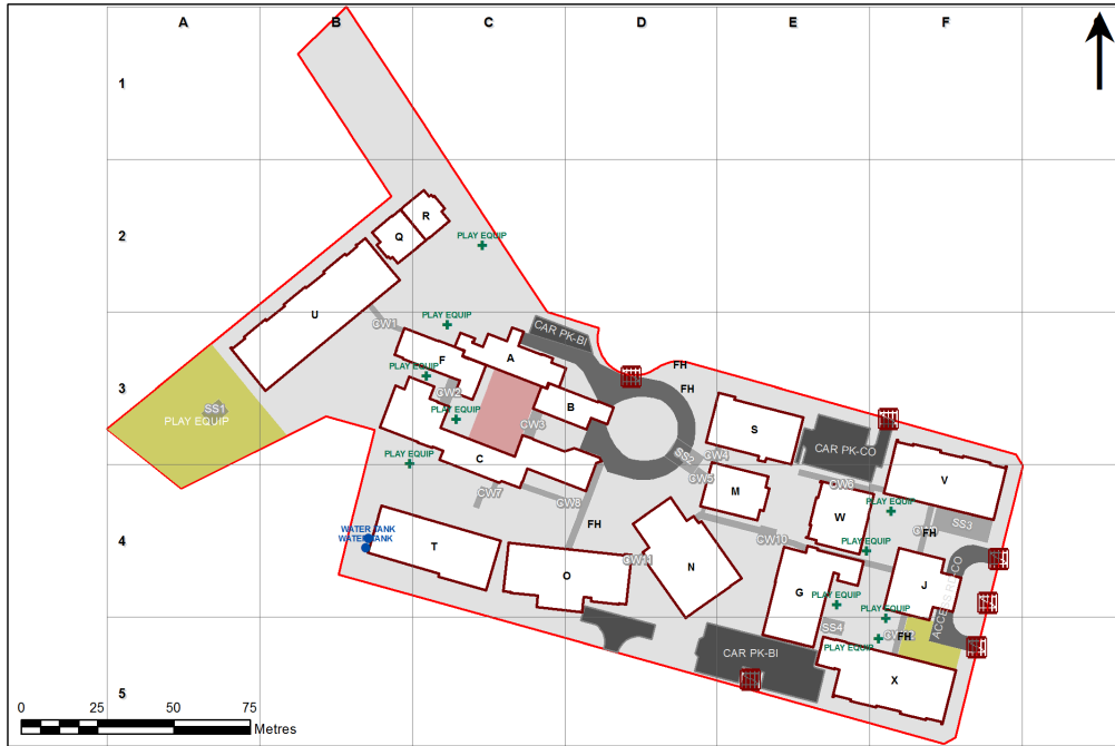
5633 - Holroyd School Site Plan (12653)