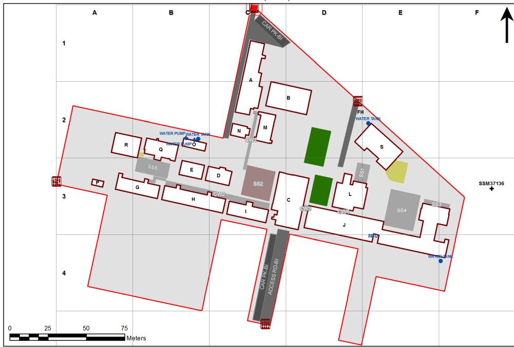
2116 - Gymea Bay Public School Site Plan (12641)