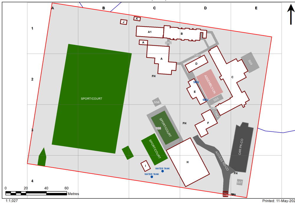
8442 - Gundagai High School Site Plan (12700)